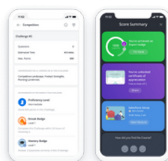
RECERTIFICATION WITH GAMIFIED EXERCISES